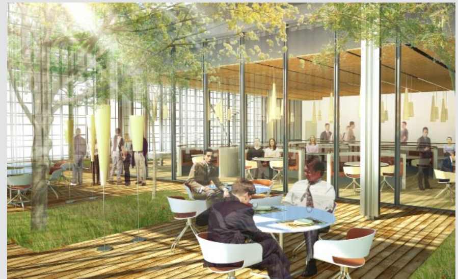
TORRE INTESA SANPAOLO - TORINO