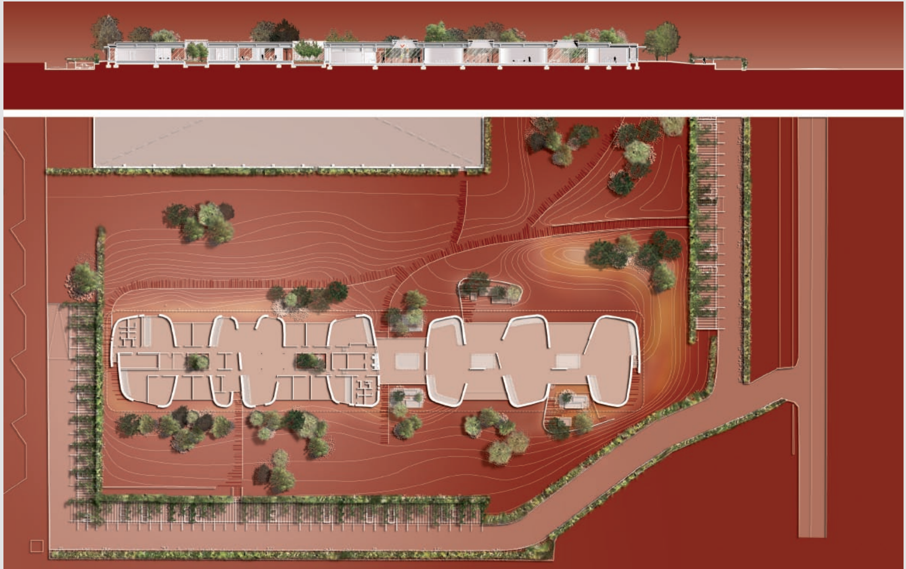
ARPER - TREVISO